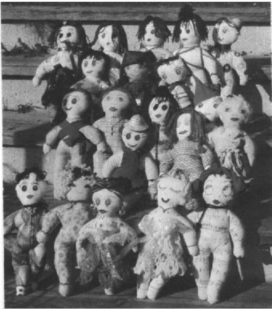
PEACE: Soroptimist s synonymous with Peace.

The Peace dolls, holding doves of peace, are hand sewn and hand decorated by European members as part of their long term commitment to the promotion of peace. Artists and famous personalities are being asked to take part and to add their signatures to the dolls as well as to the Federation's Peace Charter that all members have pledged to sign and to follow.